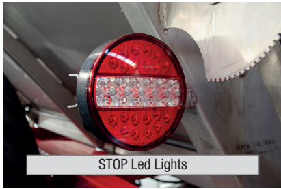
STOP Led Lights