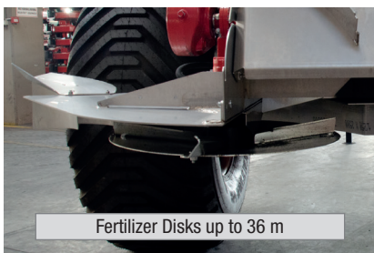
Fertilizer Disks up to 36 m