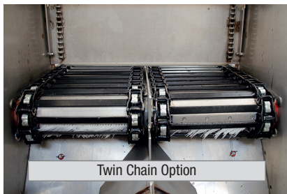
Twin Chain Option