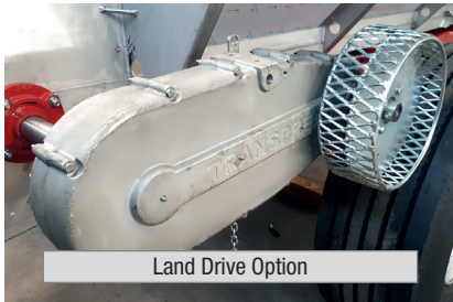
Land Drive Option