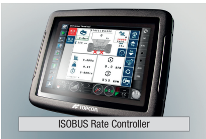
ISOBUS Rate Controller