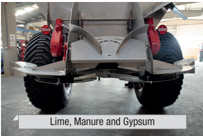
Lime, Manure and Gypsum